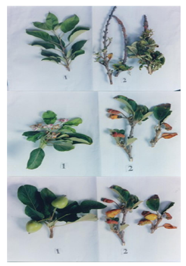
Figure 2. 1 = Healthy. 2 = Infected. A = Infected branch. B = Infected flowers. C = Infected fruits.

Sterilized pieces were soaked and suspended in SDW 30 minutes for bacterial isolate, streaked on general N. A. medium (nutrient agar) and incubated at 28^{\circ}C\pm 2 for 2-3 days. After incubation period, single colony of the presence bacteria were purified by re-streaking on N.A. medium, and then identified based on the morphological and physiological characteristics according to (Schaad, 1980; Fahy & Persly, 1983; Lelliott and Stead, 1987.