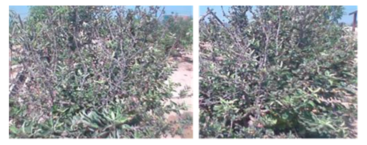
Figure 1. Symptoms on apple trees orchard (Natural infection).

affected tissues appearing brownish red. Symptoms on leaves (necrotic spots with chlorotic halo) are produced in wet conditions and are not very characteristic, though symptoms may be seen on fruits (Fig 1), (Jeans-Pierre, 1997).