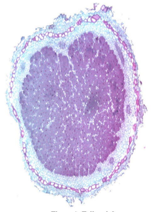
Figure 1. Full nodules