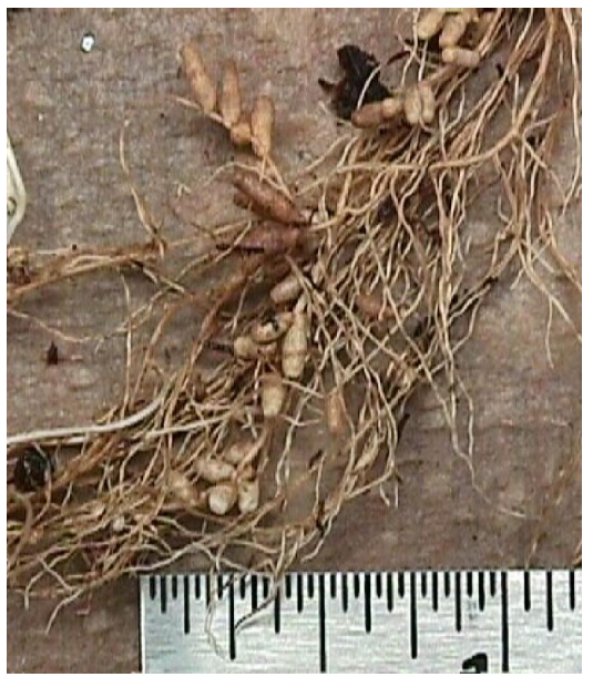
Figure 2. nodules on root