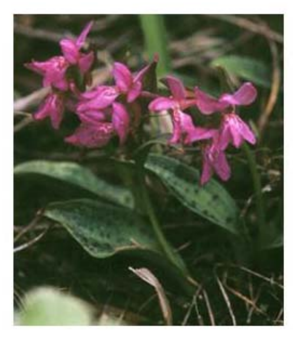
Plate I. Cluster of Chusua nana in an open grassland