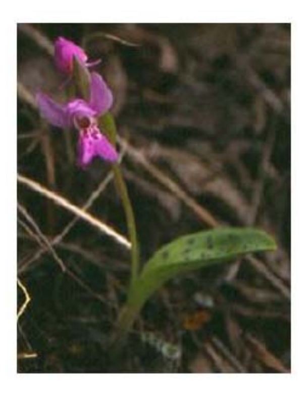
Plate II. An individual plant of Chusua nana