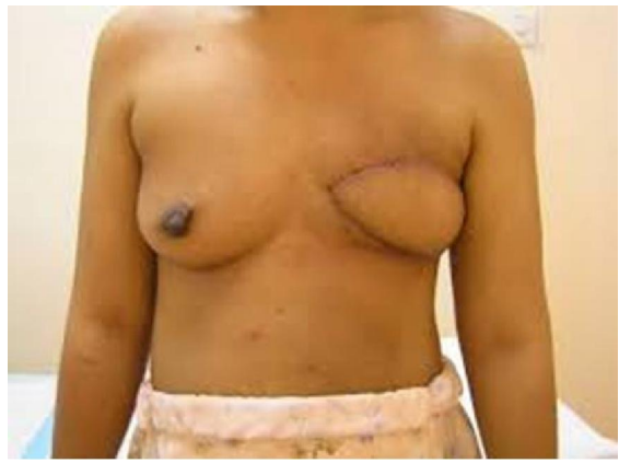
Figure 2: Post LD flap reconstruction

or radiologically. One patient had residual lesion immediately postoperative, and another patient was lost to follow up. Five patients (8.4%) had a recurrence within six months of treatment; 3 diagnosed radiologically and two clinically. Fifteen patients (25.4%) developed a recurrence within the 1<sup>st</sup> year; diagnosed radiologically in 2 cases and clinically in 13. Three of these 13 cases had sinuses discharging pus.