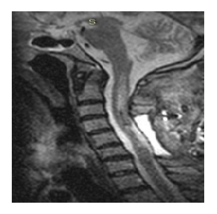
Fig. 1: Sagittal T2-weighted MRI pre and postoperative images through cervical spinal cord ependymoma show hyperintense round lesion image (left) and postoperative with mild cord atrophy (right).

hematoma, and18 (72%) patients were transferred to outpatient rehabilitation. In the minority of cases (6 cases [24%]), surgery was used alone without adjuvant radiotherapy. The median PFS in patients received adjuvant radiotherapy was 63 months (95% CI 56.31-67.68) and the 5 years PFS was 68.4%.