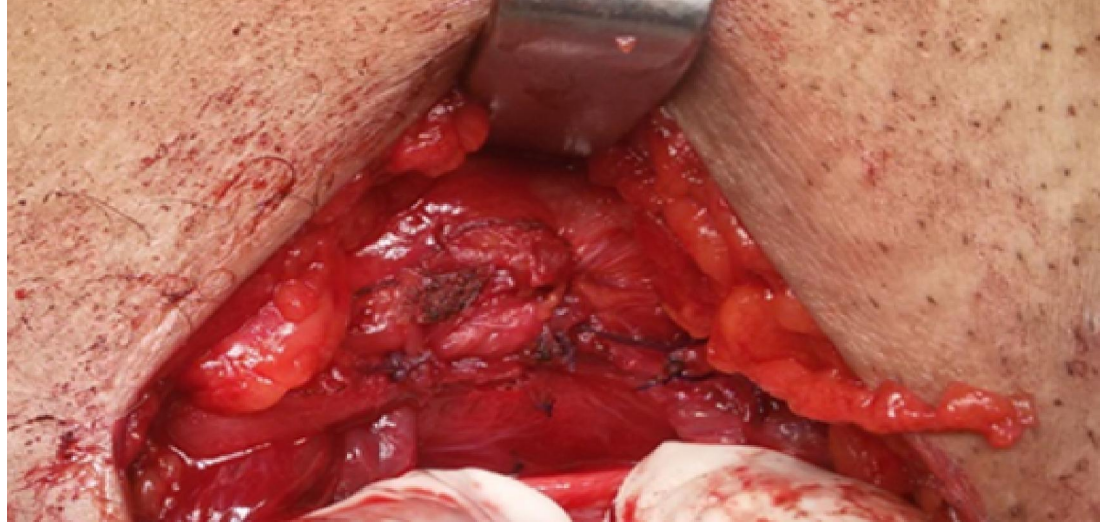
Fig. (4): The fibro cremastric sheath covers the mesh.

No need for stitching the mesh to adjacent structures as it will stay in place enveloped by the fibro cremastric sheath. The cord returned back to its normal position and the fibro cremastric sheath will prevent adhesion between the cord element and the prosthetic mesh. Also the fibro cremastric sheaths acts like a barrier between the nerves and the mesh. The external oblique aponeurosis is closed with absorbable sutures.