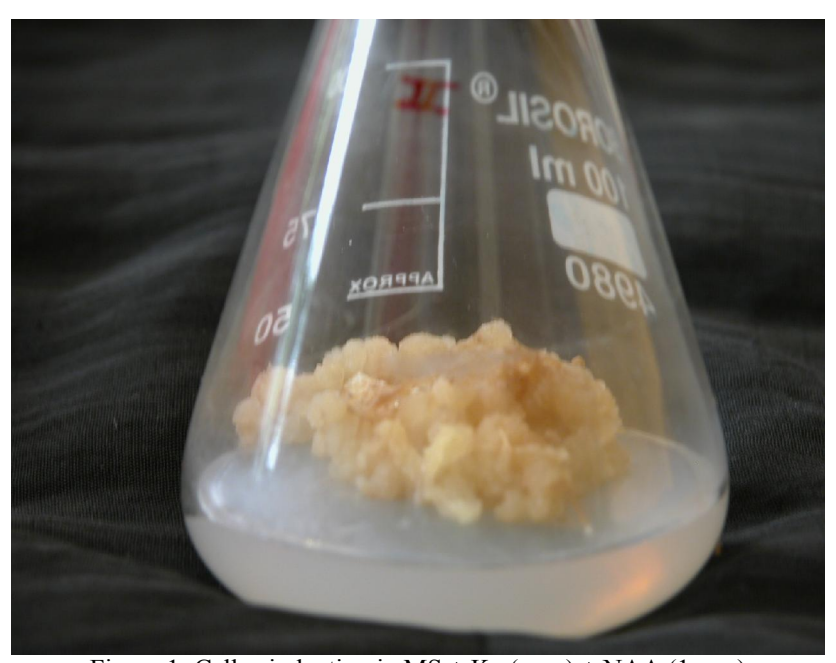
Figure 1: Callus induction in MS + Kn (ppm) + NAA (1ppm)

Values are Mean \pm S.D (++++ = very good; +++ = good; ++ = moderate)